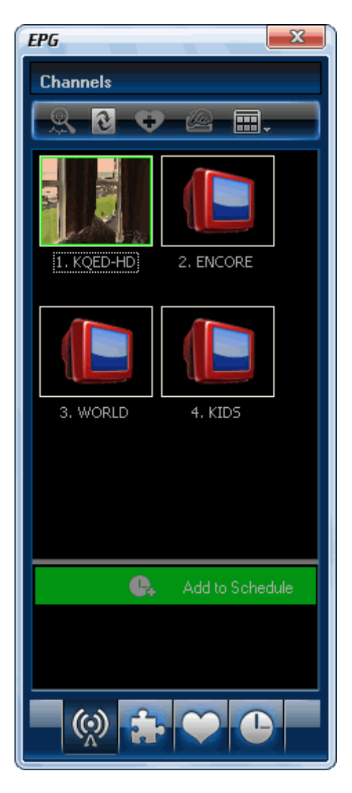
3.12 Favorite Management